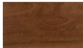
Classic Spotted Gum