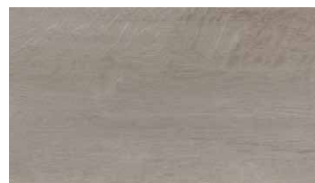
Antique White Oak